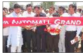
Automall Hapur 30 April 2013