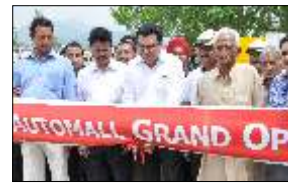
Automall Bilaspur 25 April 2013