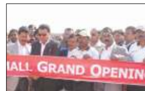
Automall Kota 27 December 2012