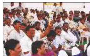
Automall Mahaboobnagar 26 February 2013