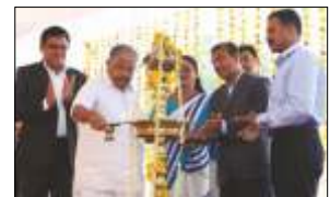
Automall Cochin 2 March 2013