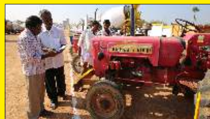
Buyers Inspecting Vehicles & Equipment