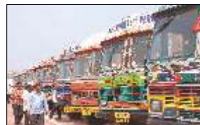
Automall Mancherial 21 March 2013