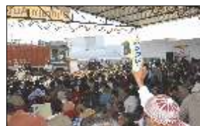
Automall Jaipur 19 December 2012