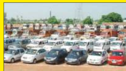
Vehicles Lineup In Automall Yard