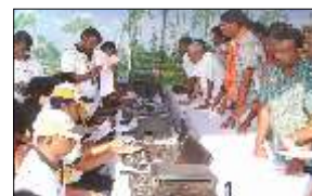
Automall Trinuvelli 15 December 2012