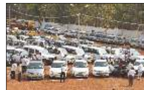
Automall Davangere 14 March 2013