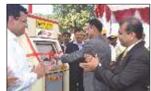
Automall Faizabad 13 December 2012

On 26 February 2011, Shriram Automall India Limited established its 1st Automall in Chennai. The Automall was inaugurated by then Honorable Union Minister for Home Affairs Mr. P.Chidambaram. The company has already launched its full-fledged facilities in 24 key locations across India. We are further stepping up to strengthen our presence all across the map of India. While we envision reaching the remotest corner of the country, it is imperative that each customer in any part of the country is provided with the same excellent local service.