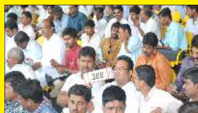
Customers Bidding For Vehicles