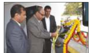
Automall Kolkata 22 December 2012