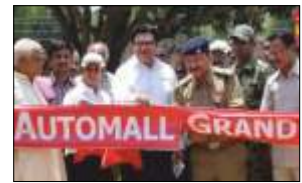
Automall Jharsuguda 18 April 2013