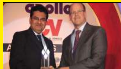
SAMIL Won Fleet Enabler Of The Year 2012 Award