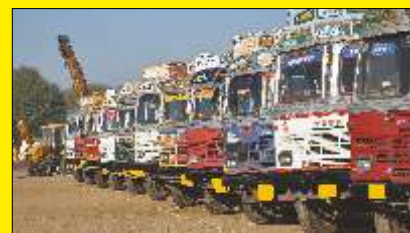
Trucks Lineup In The Yard