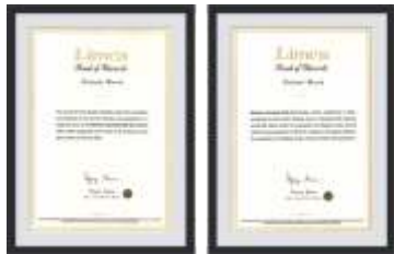
Largest Platform For Buying & Selling Of Used Vehicles And Highest Number Of Physical Events In A Single Day