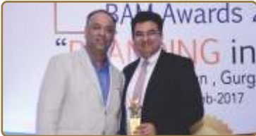
India's Most Trusted Brand In Pre-Owned Automobile Industry

Over The Years Shriram Automall Has Been Recognized By Many Industry Honchos & Expert Pundits For Offering A Transparent & Innovative Way Of Buying & Selling Used Vehicles & Equipment In The Country. This Year Was No Different, As We Were Recognized By Number Of Bodies For Our Professional Services.