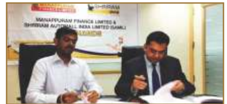
Mannapuram Finance All Segments