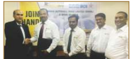
Bank of India, Mumbai All Segments