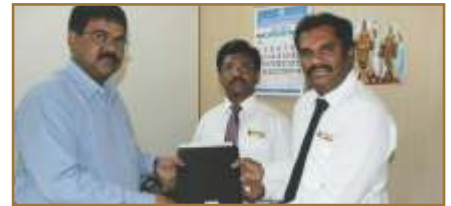
Hinduja Leyland Finance All Segments