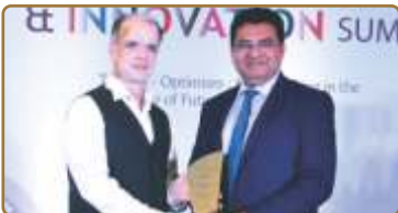
Best Disruptive Innovation Award 2016