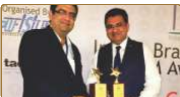
Most Promising Brand & Online Market Place in Pre-Owned Automobile Industry