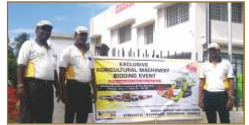
SHRIRAM AUTOMALL DISPOSED 100% UNUSED INVENTORY OF CLAAS HARVESTERS ON 26 th AUGUST 2016