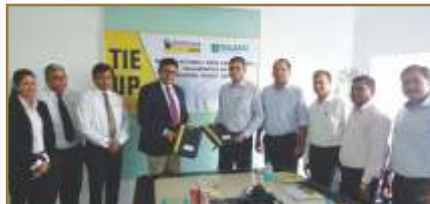
Religare Finvest Property