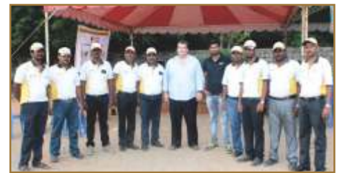
SHRIRAM AUTOMALL HELPED COPART IN DISPOSING ITS INVENTORY OF FLOOD AFFECTED VEHICLES ON 31 st AUGUST 2016