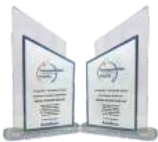
Excellence in Customer Experience & Fleet Enabler of the Year