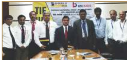
RBL Bank All Segments