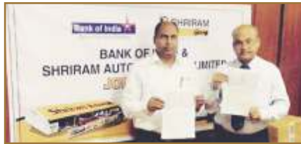
Bank of India, Ranchi All Segments

In FY 2016-17 We Went Ahead To Collaborate With Industry Leaders In Order To Bring In The Best Of Inventory For Our Customers To Choose From & At The Same Time Help The Following Banks, OEMs And NBFCs To Liquidate Their Unused Assets.