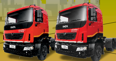
Prima LX 4928.S

WORLD CLASS PERFORMERS PARTNERS IN YOUR PROGRESS